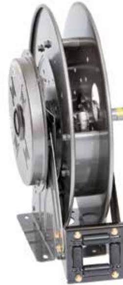
Standard configuration shown with optional full-flow swivel joint